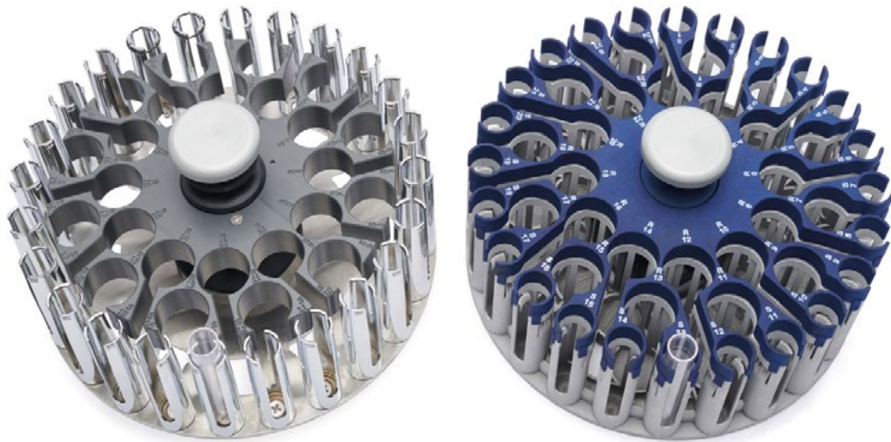
Data courtesy of Everex s.r.l

HP Multi Jet Fusion technology has replaced some of Everex’s previous production process, resulting in medical devices with fewer components, lighter weights, and lower costs to meet customer demands