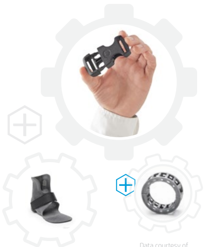
Data courtesy of OT4 Orthopädietechnik GmbH