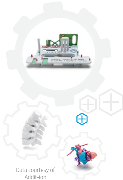
Data courtesy of Addit-ion