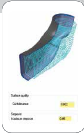
Select the port surface(s) and cut pattern