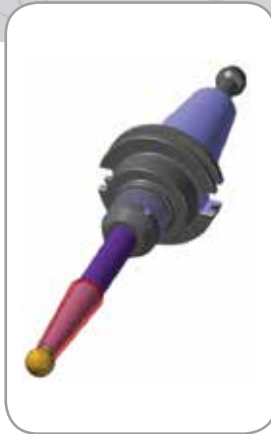
Set clearances for any part of the tool or holder